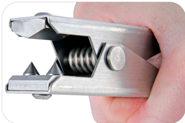
Tungsten Carbide Tips (Cen-Stat™ X45)

The clamps that exhibited consistent positive values (less than 1 Ohm) combined low surface area contact with good spring pressure. Low surface area contact, achieved via sharpened teeth (typically manufactured from tungsten carbide or stainless steel) supported by good spring pressure, enabled penetration of the entire range of test coatings.