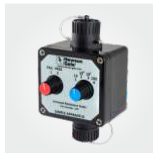
Universal Resistance Tester Product Code: URT.