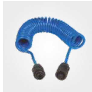
Cen-Stat cable supplied with male and female In-Line Quick-Connects.

The spiral cable provides effective retractability when the clamp is not in use, ensuring the cable is neatly stowed and safely out of the way.