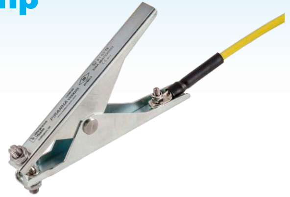
Piranha: the ergonomic static grounding clamp.

Point on Point teeth bite through rust, coatings and product build up that could resist the transfer of static electricity to ground.