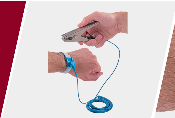
Stainless steel VESX45/PGS Personnel Grounding Strap