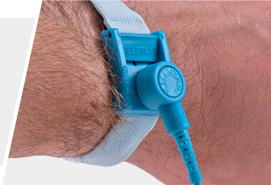
Adjustable wrist strap with quick release connector

The VESX45/PGS is a medium duty stainless steel grounding clamp and wrist strap assembly that provides operators working in hazardous areas with an additional layer of protection against fires or explosions caused by static electricity.